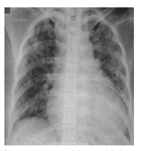
Figure 4. Anteroposterior CXR at second discharge - showed resolution of the infiltrates and opacities and the formation of fibrosis on both lungs

symptomatic COVID-19 (4–12 weeks) and pasca-COVID-19 syndrome (>12 weeks).<sup>3</sup> The clinical symptoms of this syndrome include fatigue, breathlessness, cough, joint pain,