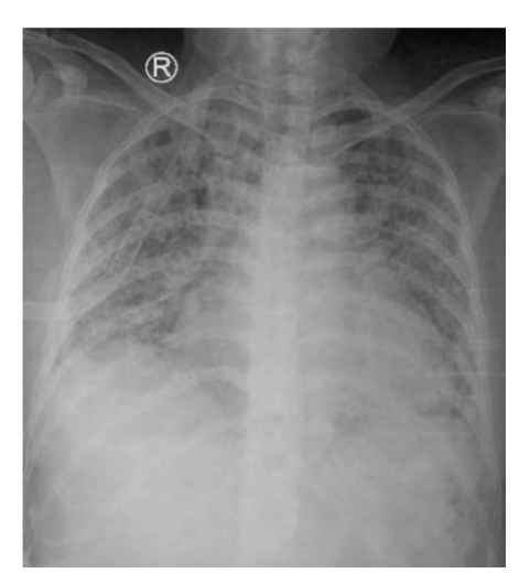
Figure 3. Anteroposterior CXR at second admission - showed infiltrates and ground-glass opacities on both lungs indicated COVID-19 pneumonia