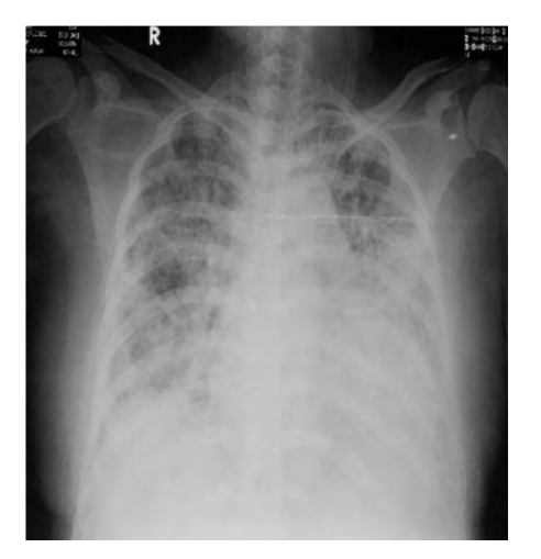
Figure2. Anteroposterior CXR at first discharge - showed infiltrates on both sides of the lungs and cardiomegaly

symptomatic COVID-19 (4–12 weeks) and pasca-COVID-19 syndrome (>12 weeks).<sup>3</sup> The clinical symptoms of this syndrome include fatigue, breathlessness, cough, joint pain,