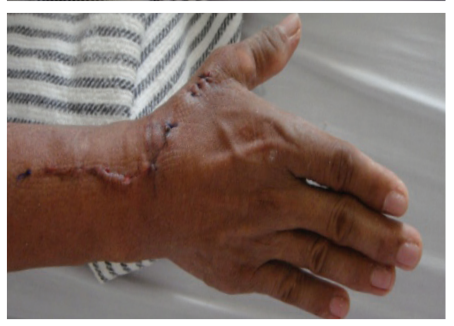
Figure 9. Motions of joints