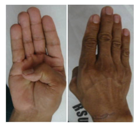
Figure 3a and b. Movement of thumb and fingers

An operation to explore and repair the ruptured tendon was performed, ruptured of Extensor Pollicis Longus (EPL) tendon was predicted. Under general anesthesia, forearm in prone position, a longitudinal incision was done on Lister's tubercle (Figure 4) and on zone T-III (Figure 5) to explore, identify, and preserve the proximal and distal stump of the ruptured EPL.