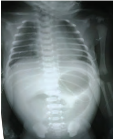
Figure 1. Abdominal plain radiograph showed distended stomach with overlapped multiple intestinal loops

jejuno-ileal atresia was made. An orogastric tube was placed and total parenteral nutrition was given.